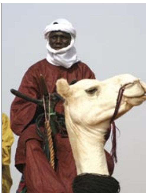
Untitled by Charlene Nagel

During her recent visits to the West African countries of Togo, Ghana, and Benin, Charlene discovered the fascinating architecture of the Tamberma and Betamaribe people. Their painted mud fortress-like compounds feature large bas-relief sculpture of such local animals as crocodiles, birds, and antelopes; fanciful mud granaries with thatched